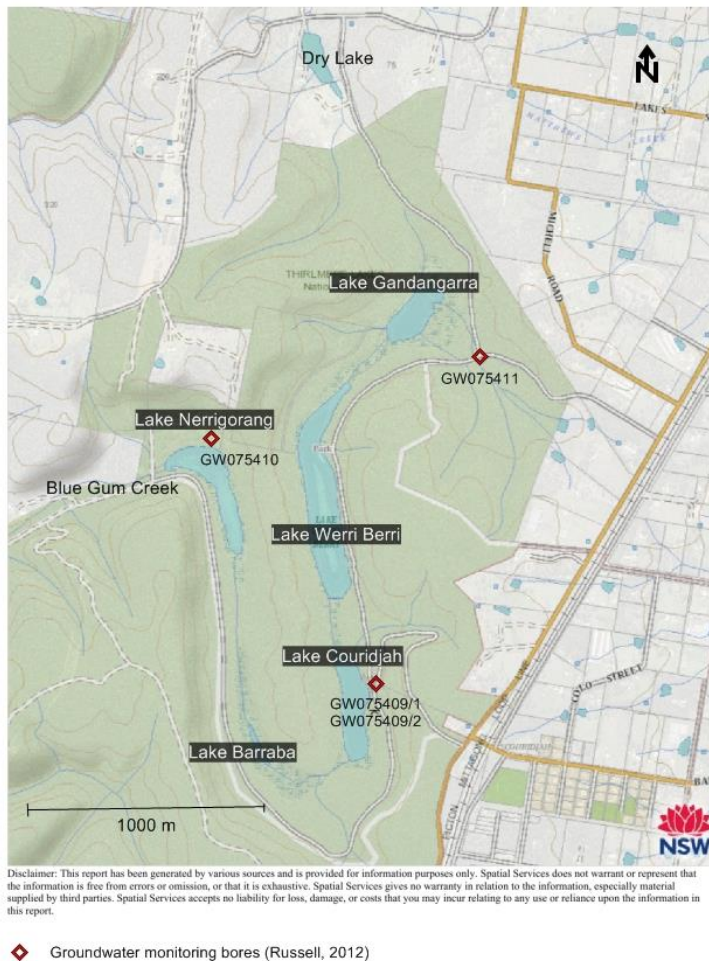
Figure 1 Thirlmere Lakes and location of existing monitoring bores

Bathymetry of Lakes Werri Berri, Couradja and Nerrigorang indicates the maximum depth of Lakes at 6.6m, 5.2m and 6.7m, respectively (Vorst (1974) and Schadler and Kingsford, 2016). Limited coring of lake sediments found it to consist from top to bottom of medium sand overlying sandy clay, changing to coarse detrital organic material classified as peat (3-4m depth). Significant change in depositional environment between peat and sand/clay sediments is due to vegetation growth at the base of the lake (Vorst, 1974). Peat and lacustrine clays were intersected in Lake Barraba and Lake Couridjah, respectively (Black, 2006 and Gergis, 2000). The peat thickness was found to be up to 3 m (between 14.3m and 17.3m below ground) while the overall thickness of the sediments in the Lakes was found to be around 20 m.